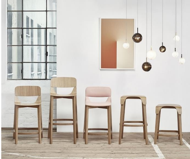
Bomma x DECHEM studio, Dark and Bright Star

The Middle East's leading design trade fair, Downtown Design returns from 13-16 November with +175 premium design brands from the region and across the world. The fair will present a new element titled Downtown Editions , a curated showcase dedicated to limited-edition and bespoke design, capsule collections and designer collaborations. Design weeks from the region, including Amman, Beirut and Casablanca , will unite within Downtown Editions, bringing co-curated showcases of some of the Middle East's brightest design talent. Under the theme of Livable Cities, this year's fair will feature an indoor garden space by landscape designers desert INK , creative pop-up concepts and installations by globally renowned designers, alongside industry talks by +25 leaders of the international design scene at The Forum .